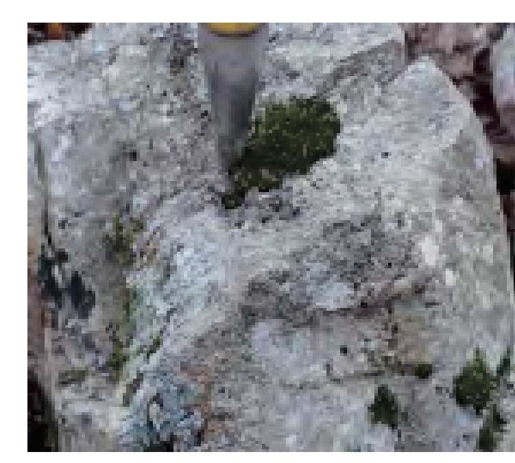
Original Stone Located and Photographed by Ron Leifheit, PLS

July - December, 2010 Volume 24 Issue 70